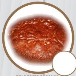
BOLO PRETO 8" ROUND (MADEIRA WALNUT CAKE)