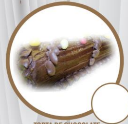
TORTA DE CHOCOLATE (YEASTER CHOCOLATE ROLL)