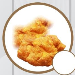
SONHOS (ROUND PANCAKE)