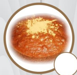
BOLO DE MEL E CANELA 8" ROUND (HONEY & CINNAMON CAKE)