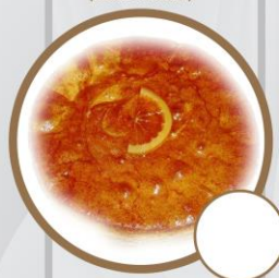
BOLO DE LARANJA 8" ROUND (ORANGE CAKE)