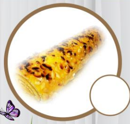
TORTA DE AMÊNDOA