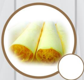
BARRIGAS DE FREIRA