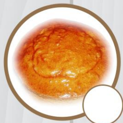
BOLO DE BANANA 8" ROUND (BANANA CAKE)