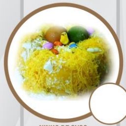
NINHO DE OVOS (VANILLA & EGG SPONGE YEASTER NEST)