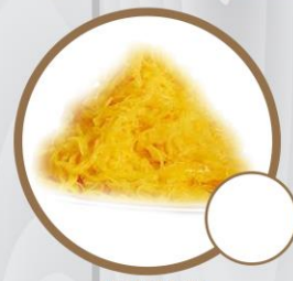
FIOS DE OVOS (PER G)