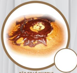
PÃO DE LÓ MARBLE (PLAIN PORTUGUESE VANILLA & CHOCOLATE SPONGE CAKE)