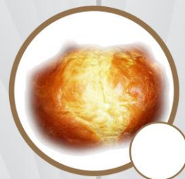
BOLO DE AZEITE