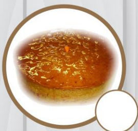
BOLO DE CENOURA 8" ROUND (PLAIN CARROT CAKE)