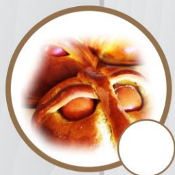
FOLAR DE PÁSCOA