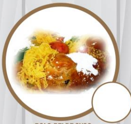
BOLO-REI DE OVOS (KING'S CAKE EGG SMALL)