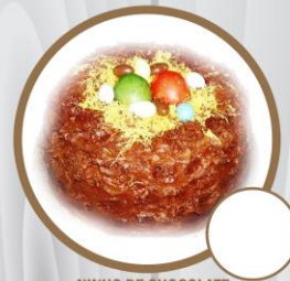
NINHO DE CHOCOLATE (CHOCOLATE SPONGE YEASTER NEST)