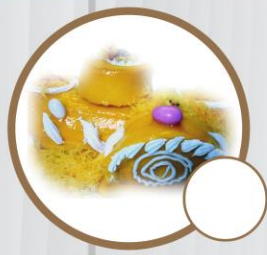
TRONCO DE OVOS (VANILLA & EGG SPONGE YEASTER LOG)