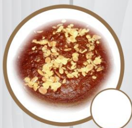
BOLO DE FAMÍLIA 8" ROUND (PUMPKIN/SULTANAS CAKE)