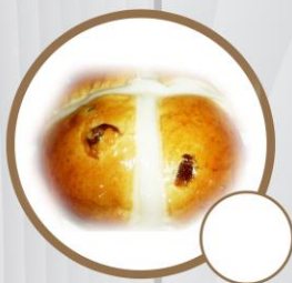
HOT CROSS BUNS