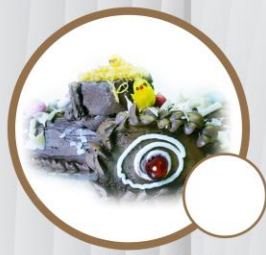
TRONCO DE CHOCOLATE (CHOCOLATE SPONGE YEASTER LOG)