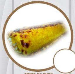
TORTA DE OVOS (YEASTER EGG CREAM ROLL)