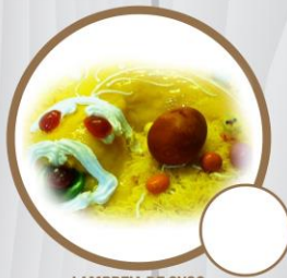
LAMPREIA DE OVOS (EGG YOLK CAKE)